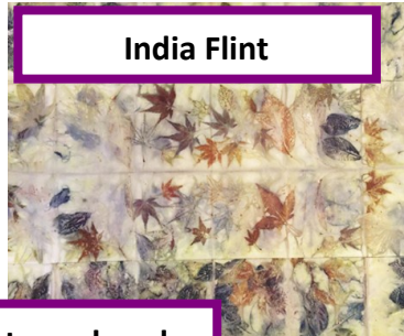
Famous Artists explored